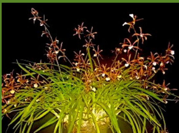
**Special Rosette** Encyclia bractescens Grown by B. Ellingsen